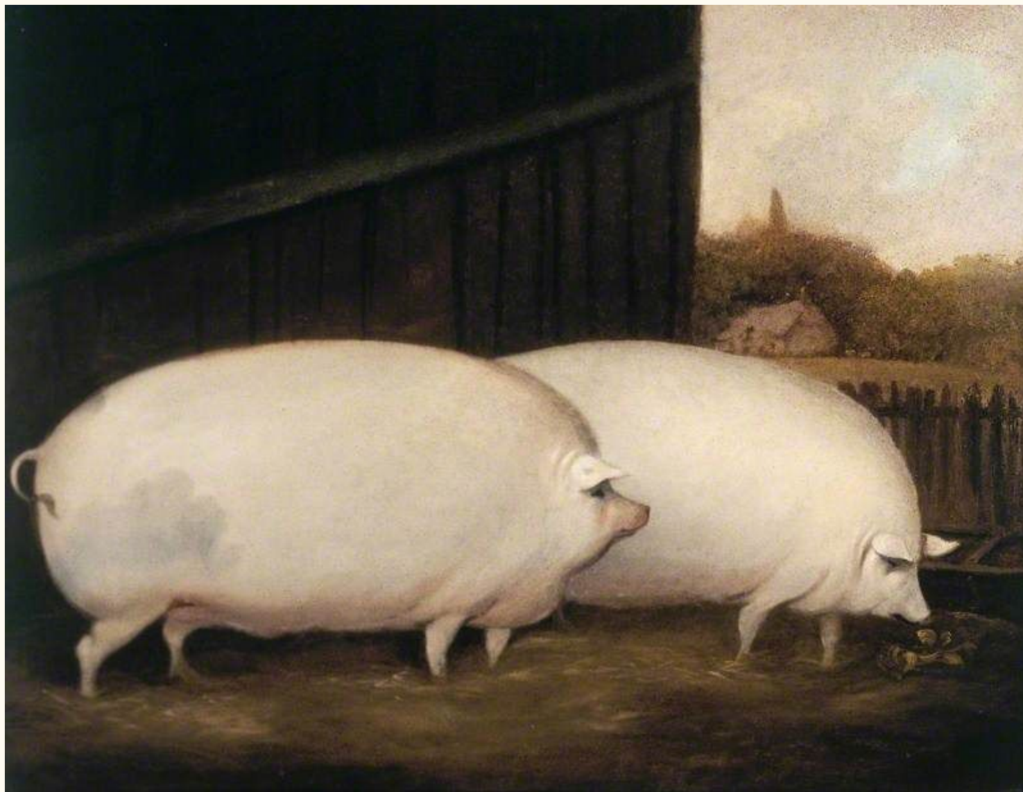
Unknown Artist, A Pair of Pigs (c. 1850)

Oil on canvas, Compton Verney Art Gallery and Park, Warwickshire