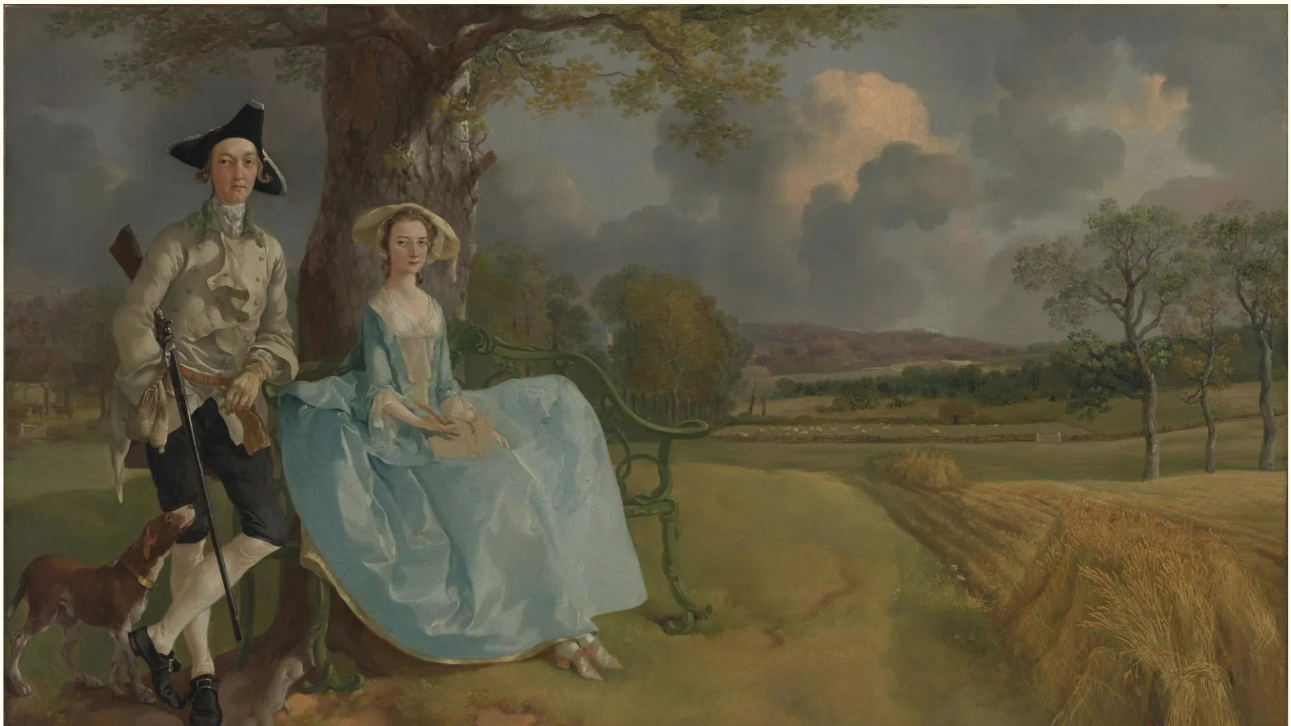
Thomas Gainsborough, Mr and Mrs Andrews (c. 1750)

Oil on canvas, The National Gallery, London