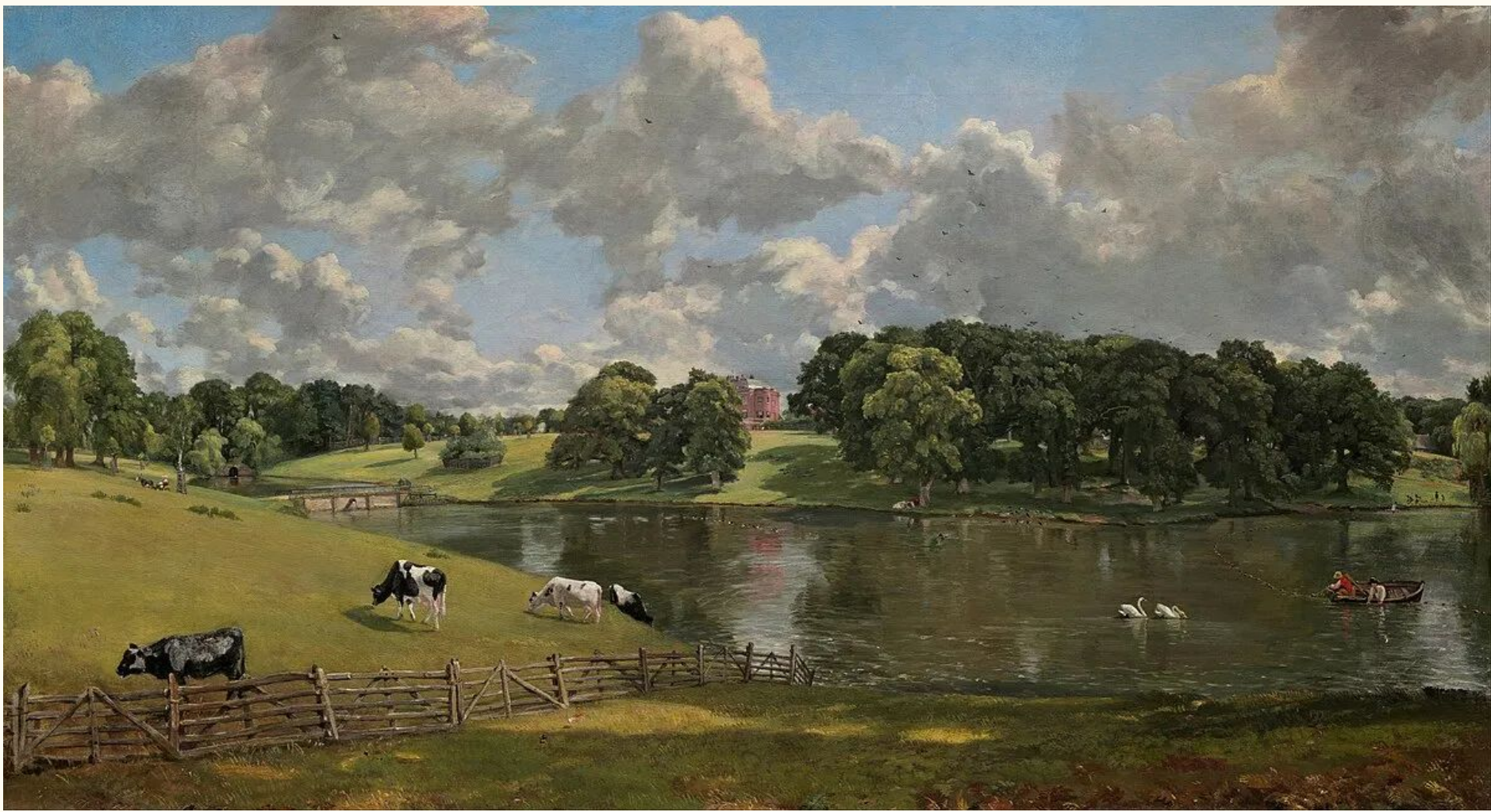
John Constable, Wivenhoe Park, Essex (1816)

Oil on canvas, National Gallery of Art, Washington, D.C.