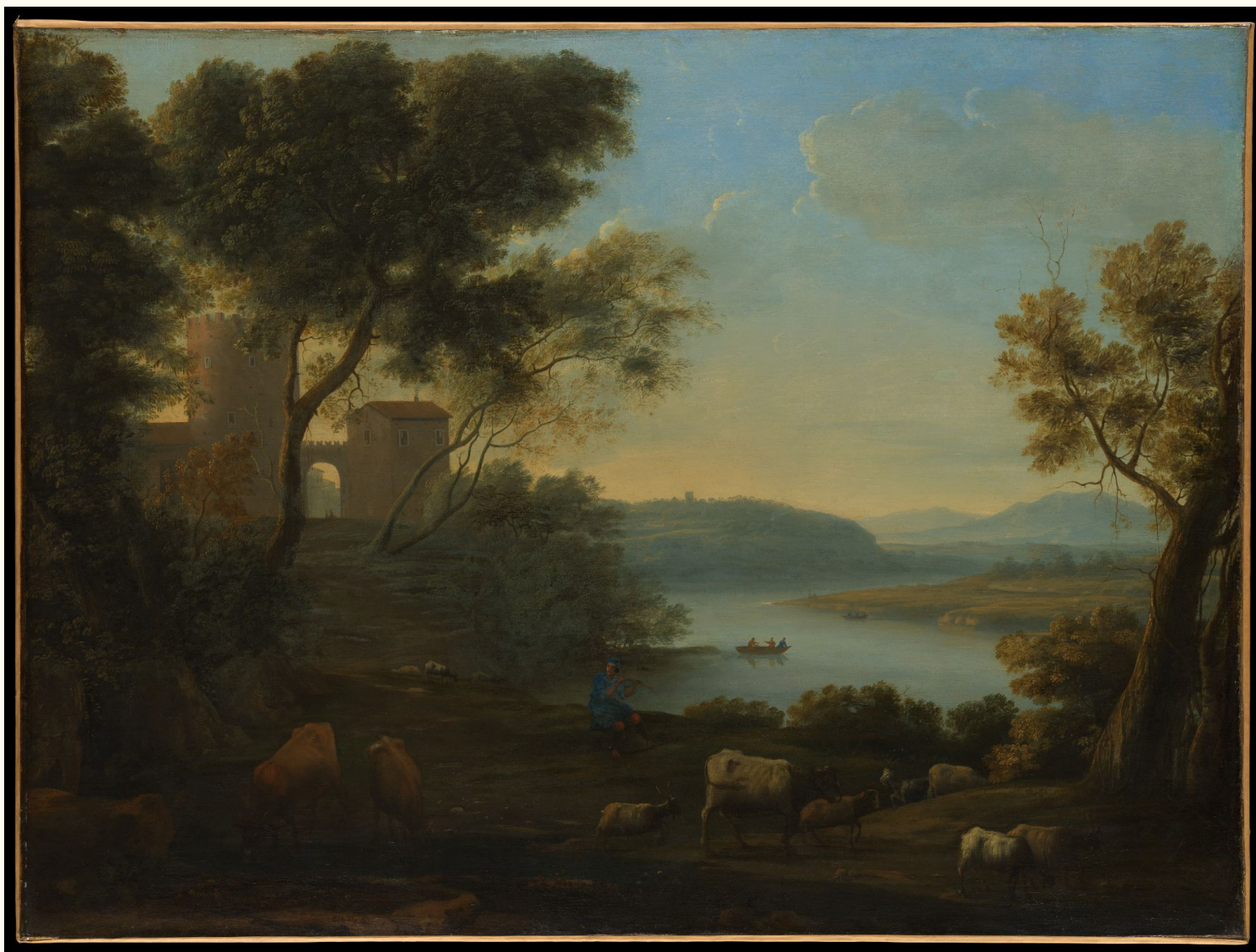
Claude Lorrain, A Pastoral Landscape (c. 1648)

Oil on canvas, The Metropolitan Museum of Art, New York