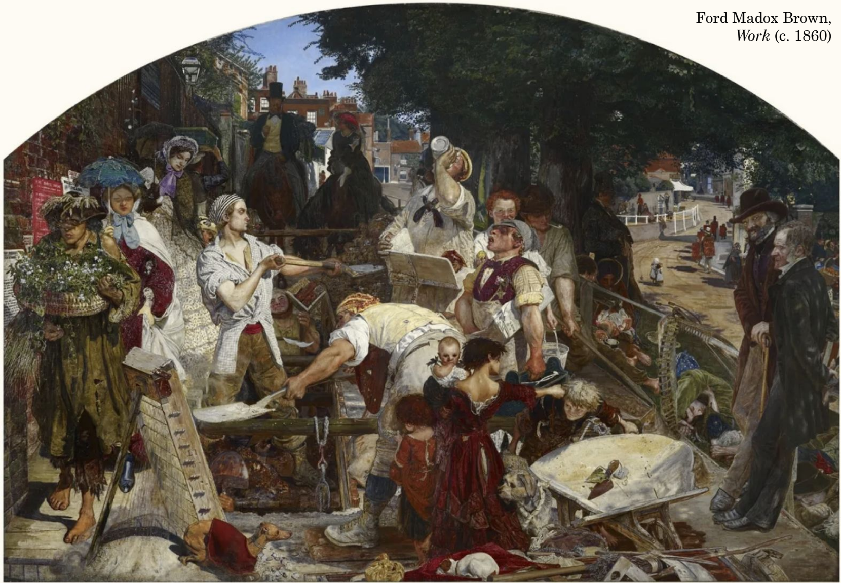
Ford Madox Brown, Work (c. 1860)