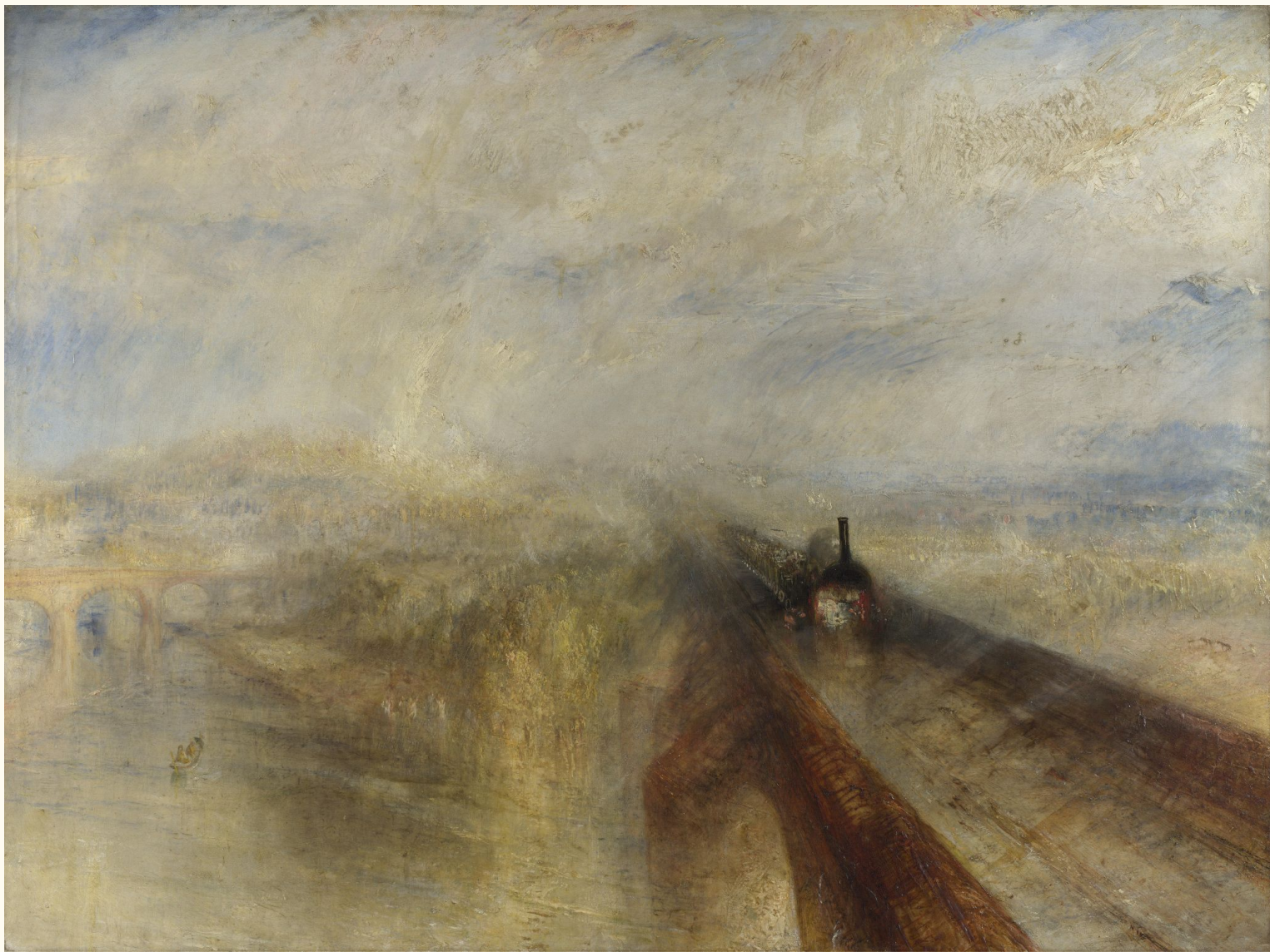
J.M.W. Turner, Rain, Steam and Speed – The Great Western Railway (1844)

Oil on canvas, The National Gallery, London