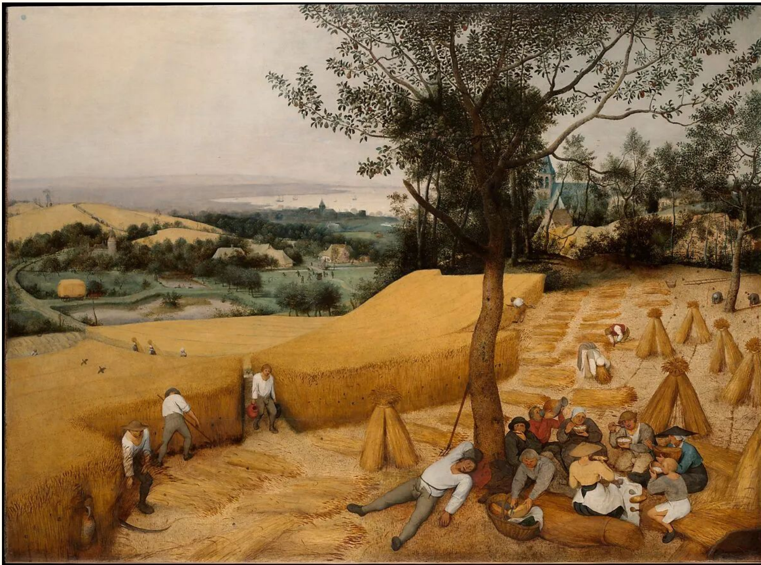
Pieter Bruegel the Elder, The Harvesters (1565)

Oil on wood panel, The Metropolitan Museum of Art, New York