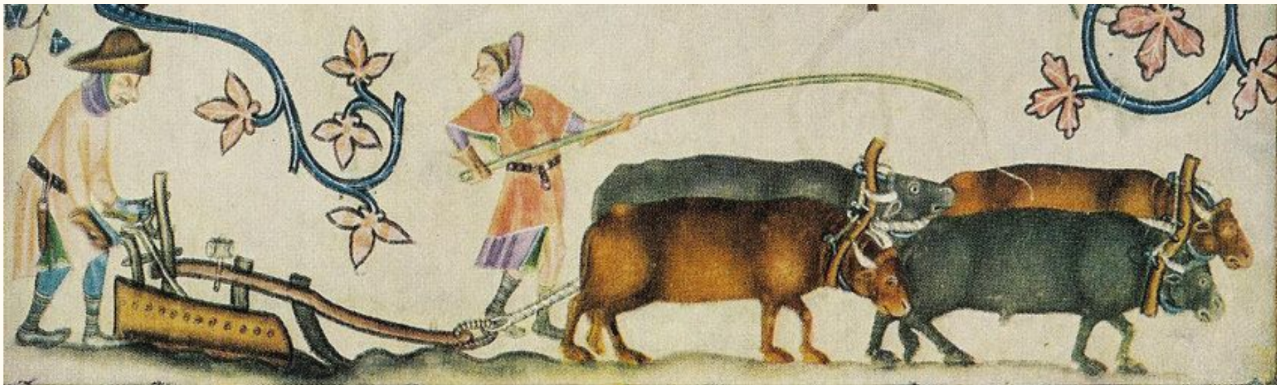
Anonymous, Scene from the Luttrell Psalter , c. 1325–1340

Illuminated manuscript on parchment, British Library, London