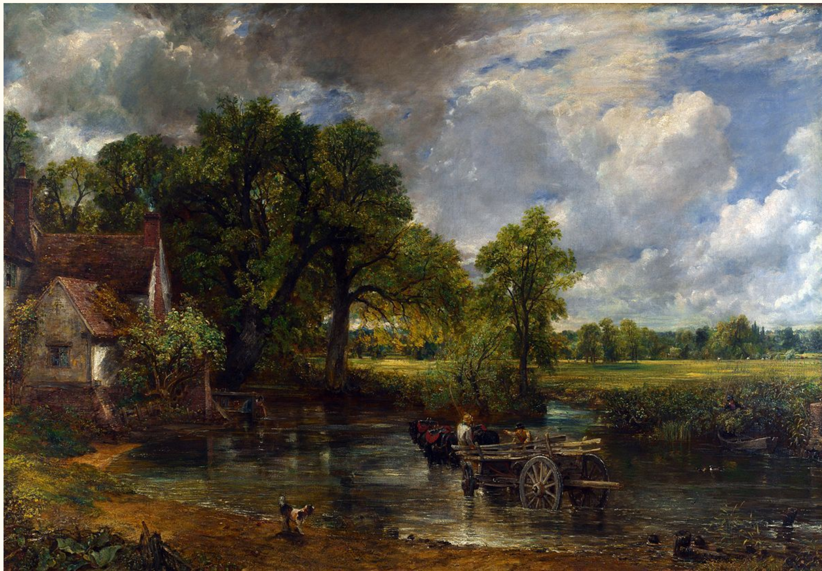
John Constable, The Hay Wain (1821)

Oil on canvas, The National Gallery, London